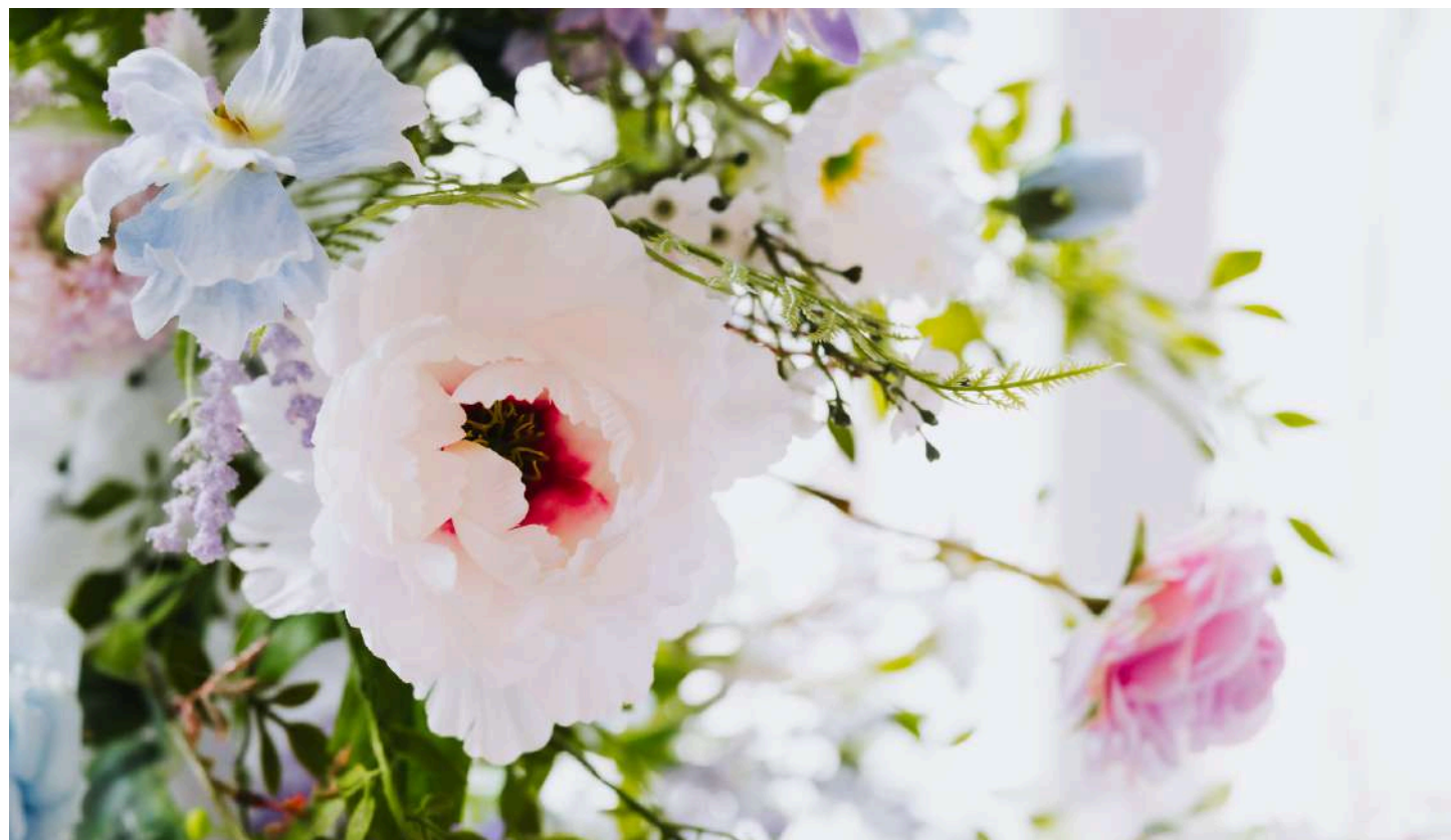
STANDARD SOLEMNISATION DECORATION JAN 2026 - JUNE 2026